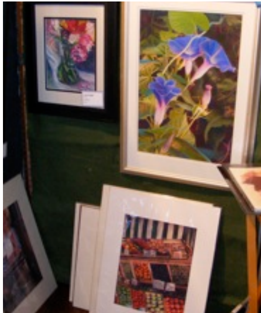
Deb Dahlin displays pastel flower portraits at Sollecito's Landscaping. (above)