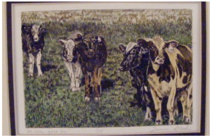
Tammy Slank used a lot of elbow grease on all of her solar plates! Watercolor was used to enhance the prints. (top and lower left)