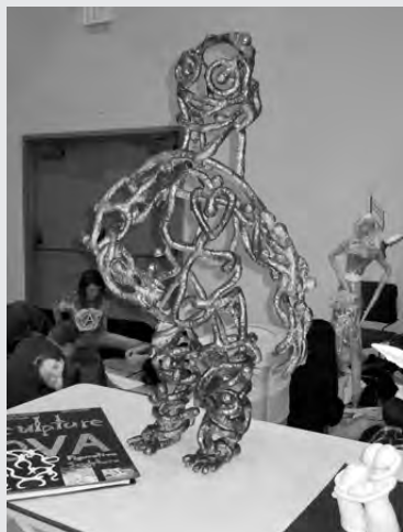
Schenectady HS Sculpture entry 2011