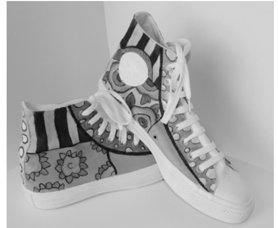
Artist Maria Hoover

Items could include scarves, flip-flops, earrings, bracelets, pins, necklaces, t-shirts, tank tops, shawls, reading glasses, aprons, masks, belts, socks, hats, shoes, handbags, etc., etc., etc. If you can wear it, and it's creative and fun, it's exactly what we're looking for!