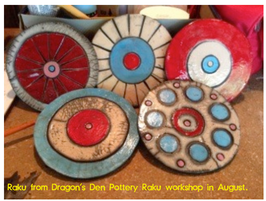
Professional Development & Workshops

Please consider hosting a program in your area so that all 9 counties are featured in our region. Send proposals, photos, and details for possible consideration.