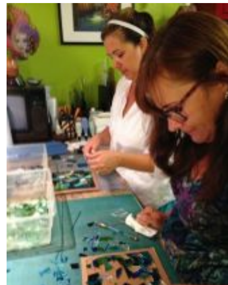
Photos from Eye Studio Glass workshop in July.